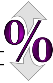
Price Change Advisor